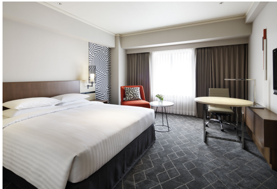
Courtyard Room King

The interior design of the 332 rooms is featured by earth color and abstract patterns. Each room is spacious and furnished with a large writing desk, realizing a refreshing and functional space. Free Wi-Fi service is available anywhere in the hotel. This is the first hotel in Japan where Marriott's mobile check-in function is applicable. The hotel also has restaurants, bars, conference facilities and a fitness room (open 24 hours), all of which help you enjoy a comfortable and refreshing time.